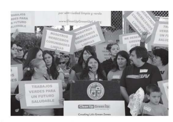
Figure 11.5 Members of Clean Up Green Up, an L.A. Environmental Justice Advocacy Group, Hold a Press Conference in Support of Their Goals

As part of empowering LA http://empowerla.org/tag/clean-upgreen-up/