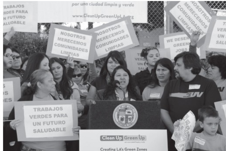
Figure 11.5 Members of Clean Up Green Up, an L.A. Environmental Justice Advocacy Group, Hold a Press Conference in Support of Their Goals